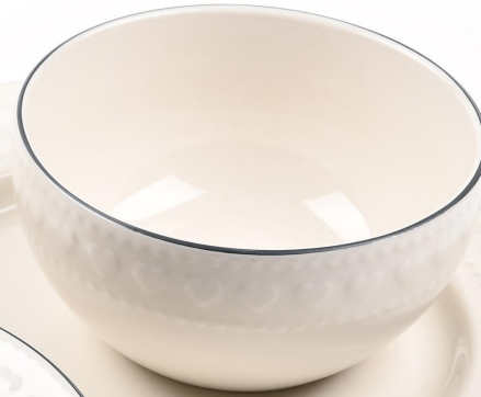
5.5 inch bowl