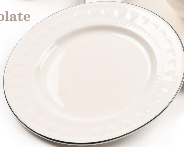
7.5 inch plate